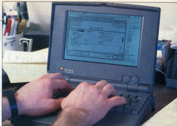
Local radio announcers may have inside information about companies you need. Make contact, then keep in touch.

video production. Again, fax those press releases!